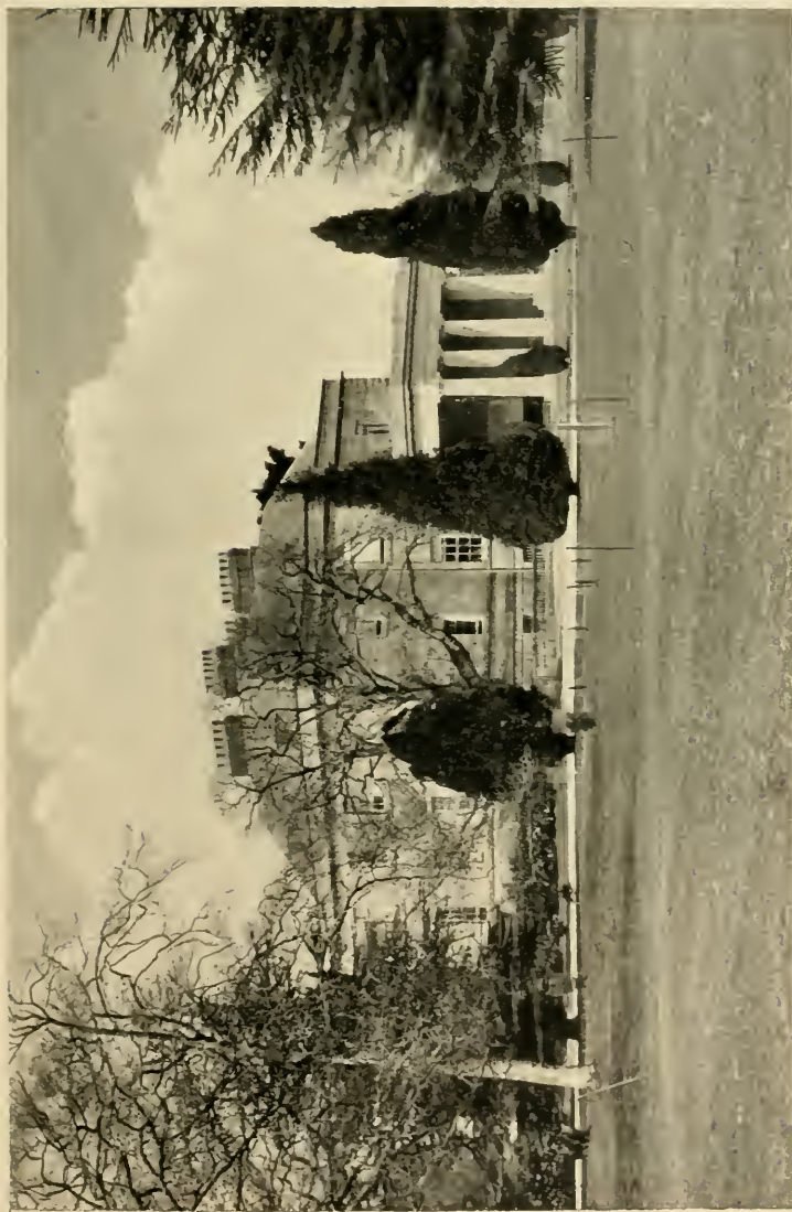
STOVER AT THE PRESENT TIME